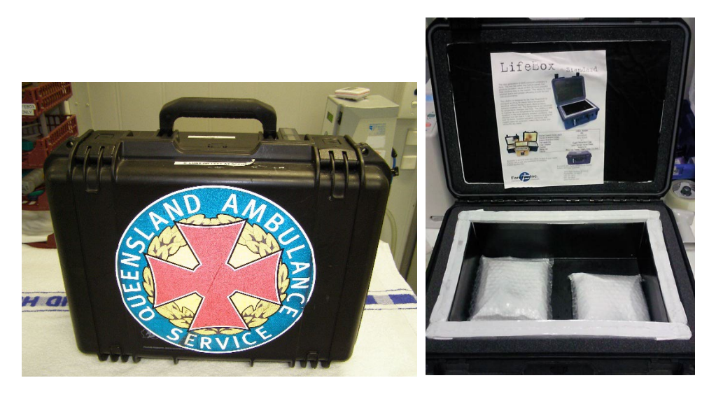
Figure 1: Lifebox