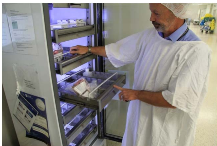
The RFID fridge in use at Liverpool Hospital

After considering several other potential solutions, Liverpool hospital decided to pursue the implementation of low frequency RFID tagging of blood. In November 2011 a business case was prepared for an RFID smart blood fridge to be located in the operating theatre. Although there were multiple vendors in Australia offering differing RFID solutions, none had a system in use, meaning that Liverpool Hospital would be the first Australian hospital to implement such a system.