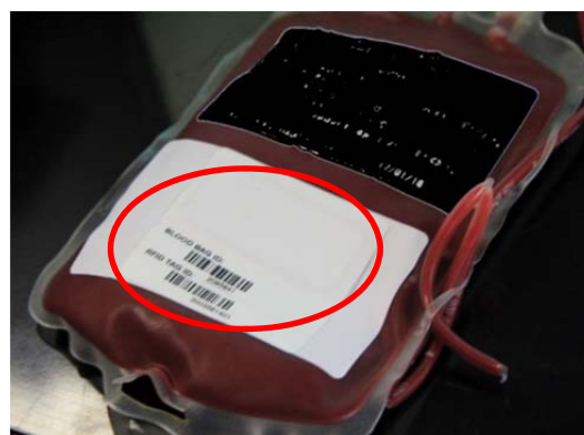
A blood bag equipped with an RFID label

RFID stands for Radio Frequency Identification. It is a wireless, non-contact form of communication which uses electromagnetic radio waves to transfer data between a tag and a reader. RFID tags consist of a small circuit board coupled to an antenna. Passive RFID tags are powered by temporary electromagnetic fields which facilitate the transmission of radio frequency data from tag to reader. Tags can be read even if covered by an object or not visible and hundreds of tags can be read at a time. RFID tagged blood products can transmit pack details and patient identification information to a computer or hand held device.